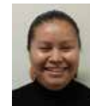
Morning Dove Hall OKANAGAN INDIAN BAND Simon Fraser University First Nations Language Proficiency Program